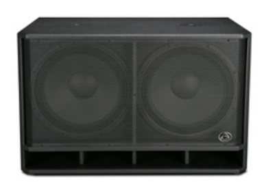
DVP-X218B 2 x 18" subwoofer, 4Ω 138dB Max SPL 2000w Programme 4000w Peak