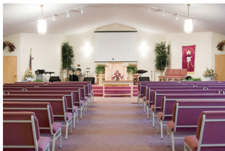
Houses of worship