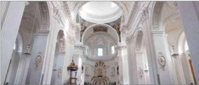
Houses of Worship