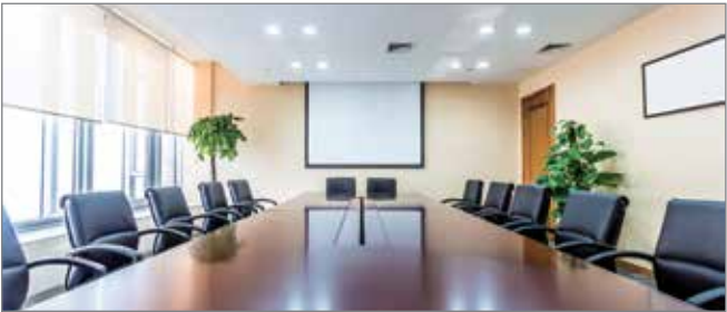
Auditorium, seminar/meeting rooms