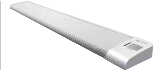
AM-1W Array Microphone