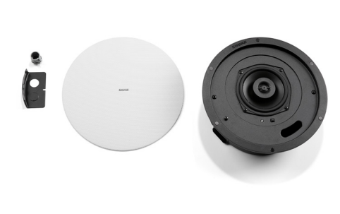
IN THE BOX (Included)

The paintable grille is available in white to match most drop ceiling tiles and features removable magnetic Shure logo.