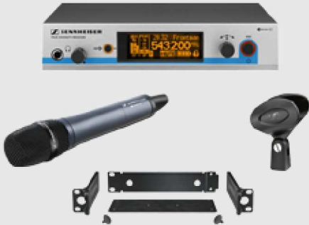
ew 500-935 / 945 / 965