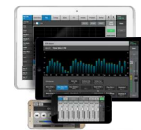
TouchMix Control App for iOS* and Android* devices

The TouchMix-30 Pro includes two real-time analyzers (RTA). One RTA may be displayed along with the equalizer of any currently selected input or output channel. A second, independent RTA may be assigned to display the audio signal of any output, the Cue buss or the Talkback microphone input. TouchMix-8/16 models include a single RTA.