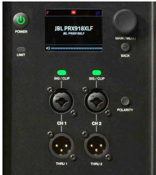
REAR PANEL CONNECTIONS

The JBL PRX918XLF , part of the JBL PRX900 Series powered loudspeakers and subwoofers, takes professional portable PA performance to a new level with advanced acoustics, comprehensive DSP, unrivaled power performance and durability, and complete BLE control via the JBL Pro Connect app.