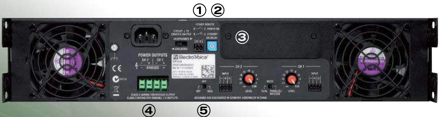
CPS2.x rear view

Like the CPS multi-channel amplifiers, CPS two-channel models also include a module slot for the RCM-810 remote-control module, enabling networking services for remote system diagnostics and control via IRIS-Net software.